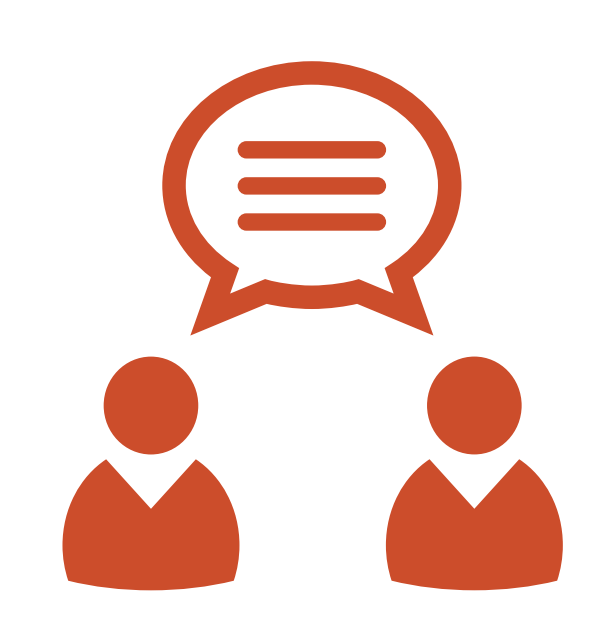
Return of Social Capital

Giving people hope, a positive future outlook and meaningfulness.